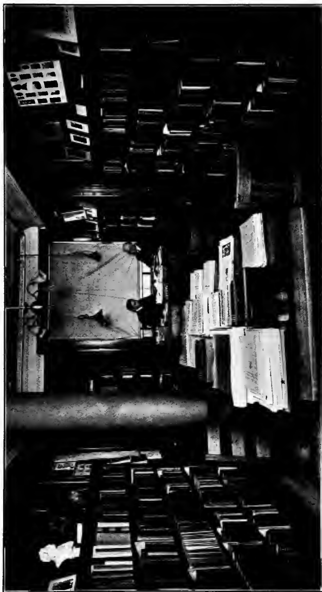
Administrative center of National Federated Protestant Movements